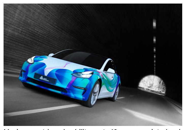
Maximum outdoor durability, up to 10 years unprinted and 6 years printed*.