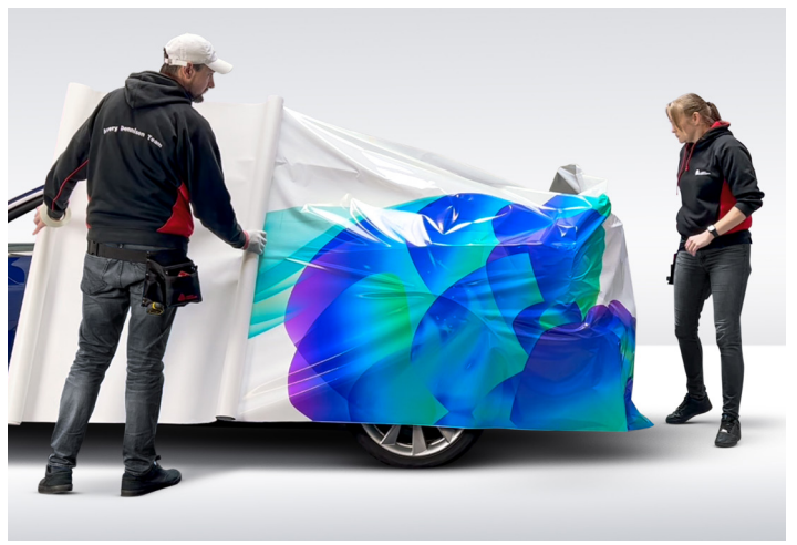
Easy repositioning due to Easy Apply™ technology and a low initial tack.